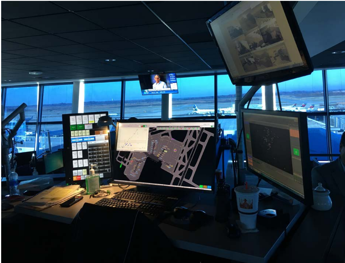
ATD-2 Ramp Manager Workstation during 1 st Surface Metering Evaluation

On 11/29/2017 The ATD-2 Project team initiated the first evaluation of a Surface Metering capability consistent with the Surface CDM Concept of Operations. The capability was tested during Bank 2 as scheduled. This accomplishment marks the fulfilment of the FAA NIWG commitment for surface. Surface metering will continue being evaluated at Charlotte through the duration of ATD-2.